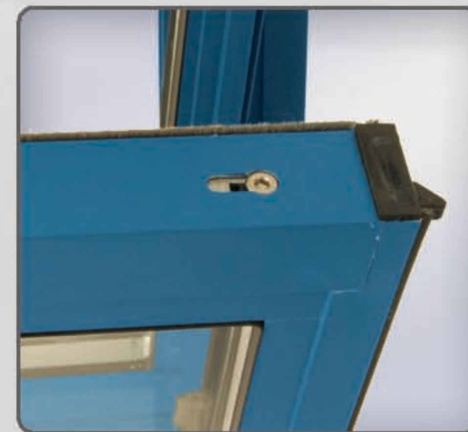
Concealed Tilt Latches