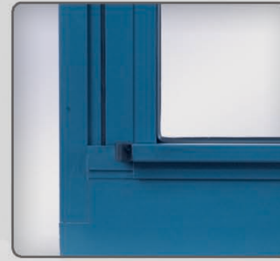
Continuous Lift Rail