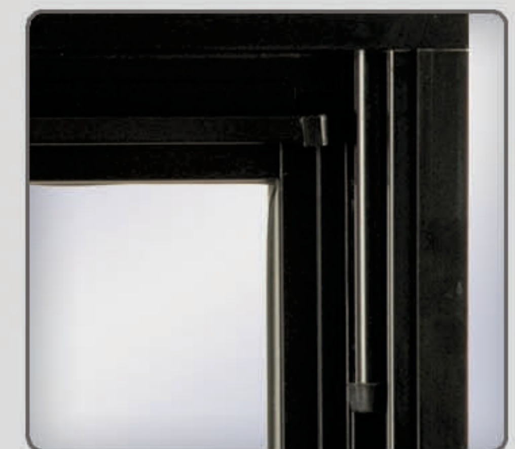
Metal Sash Stops